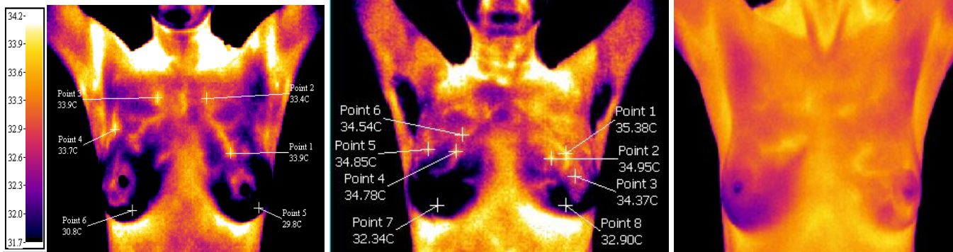
Bilateral Mammary Duct Infection